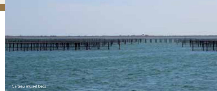
Carteau mussel beds