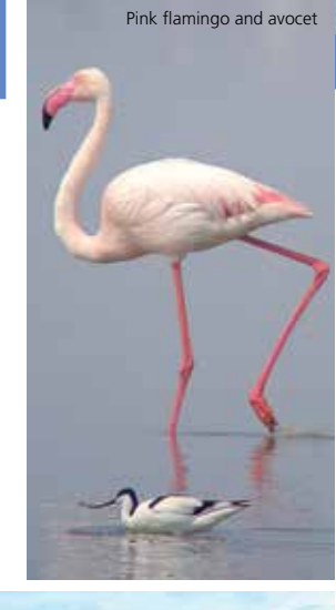
The "Sansouire" (saltwort plains)

The Camargue National Preserve was created in 1927 by the French National Society for Nature Protection, in order to protect plant and animal species. The Preserve covers 13,117 ha, of which a large part is occupied by the Vaccarès Pond. La Capelière is a tourist information center managed by the National Preserve. You will find there discovery trails, exhibitions, documents.