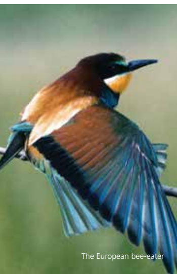
The European bee-eater

Its back is brown with bluish-green breast, a yellow throat and a black collar ring, with olive green wings and tail – it looks like it escaped from an exotic bird cage! You can see this bird in the spring and summer, when it builds its nest in the banks along the roads and canals. Its name comes from its favorite food : bees or wasps.